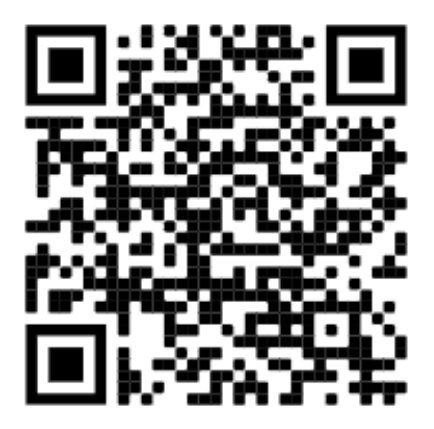
UN Resources on Day of Peace

Extended Gratitude to Brookside Community Church for providing the event flyer The Community of St John Baptist, Mendham for providing the event programs