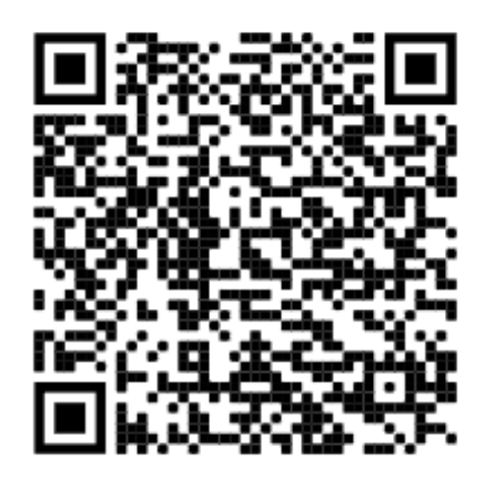
Digital Program to Share

HOSTED BY FAITH LEADERS FROM CHESTER, MENDHAM, AND LONG VALLEY