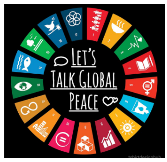
UN Sustainable Goals